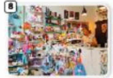
8 gift shop