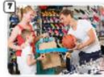
7 sports shop