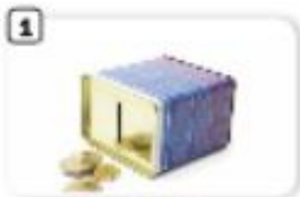
1 money box