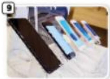
9 phone shop