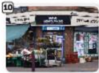
10 corner shop