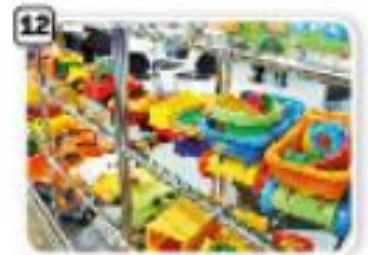
12 toy shop