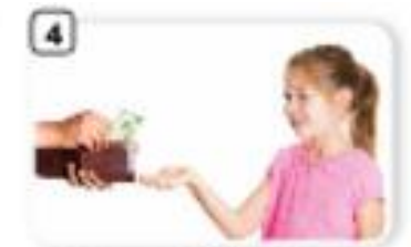
4 earn pocket money