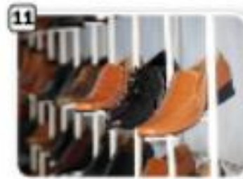
11 shoe shop